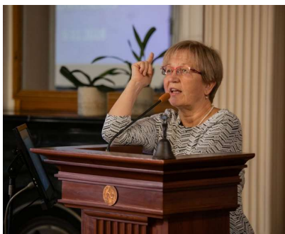
NICPB research Instituto- Estonia