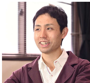
Okayama University- Japan